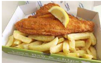
Fish and Chips CHF. 26.00