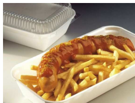
Schweinsbratwurst mit Pommes Frites CHF. 14.00

Das Fleisch (100% Rind) ist ausschliesslich Schweizer Herkunft. Der Fisch stammt aus Deutschland (Nordsee).